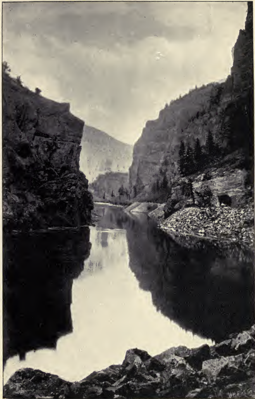
CANON OF THE GRAND RIVER NEAR GLENWOOD SPRINGS SHOWING THE MIRROR